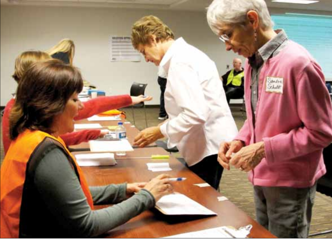
Left: Community members gain valuable disaster preparation experience during the Emergency Volunteer Center training, October 2010.